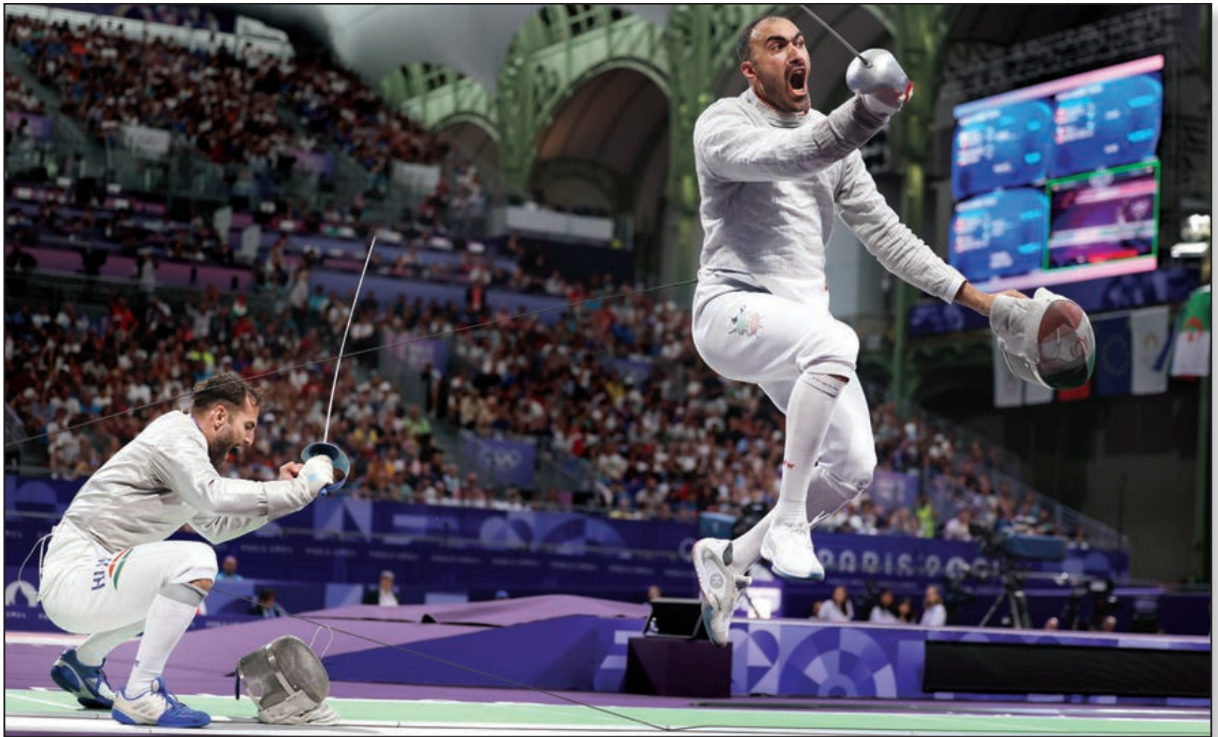
SPORTS PHOTO Division F 1st Place: Chicago Tribune, Brian Cassella