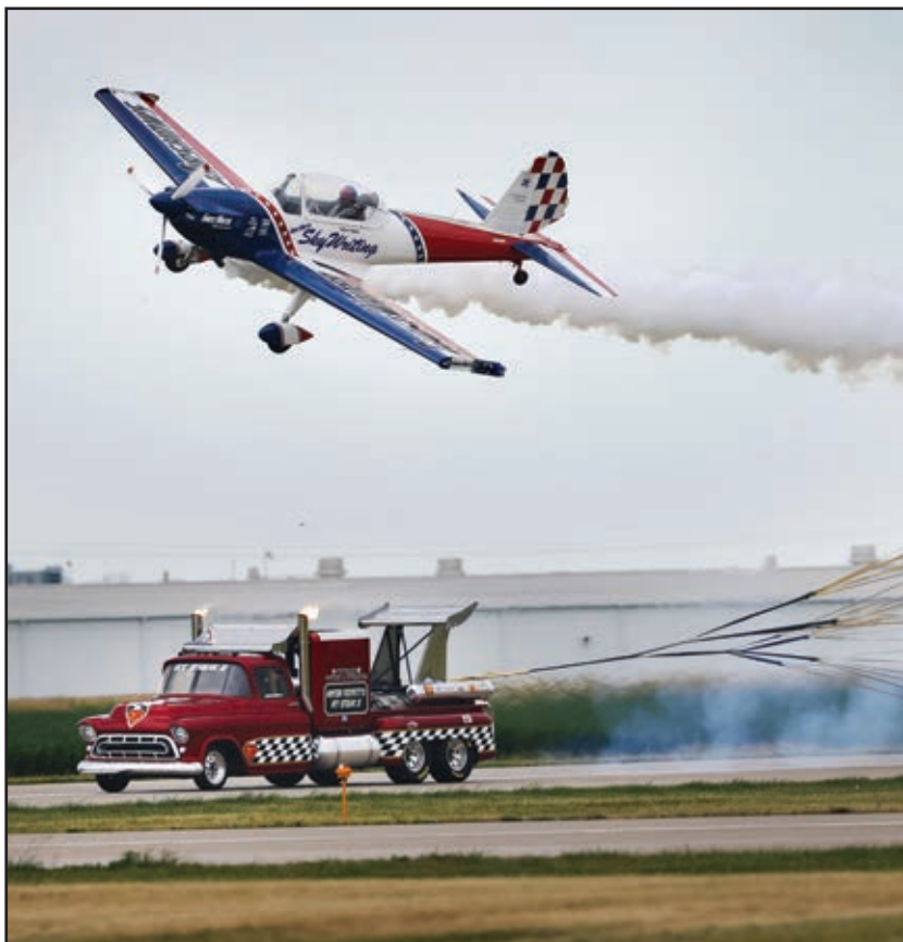
FEATURE PHOTO Division E 1st Place: The Dispatch · The Rock Island Argus, Moline, Roy Dabner