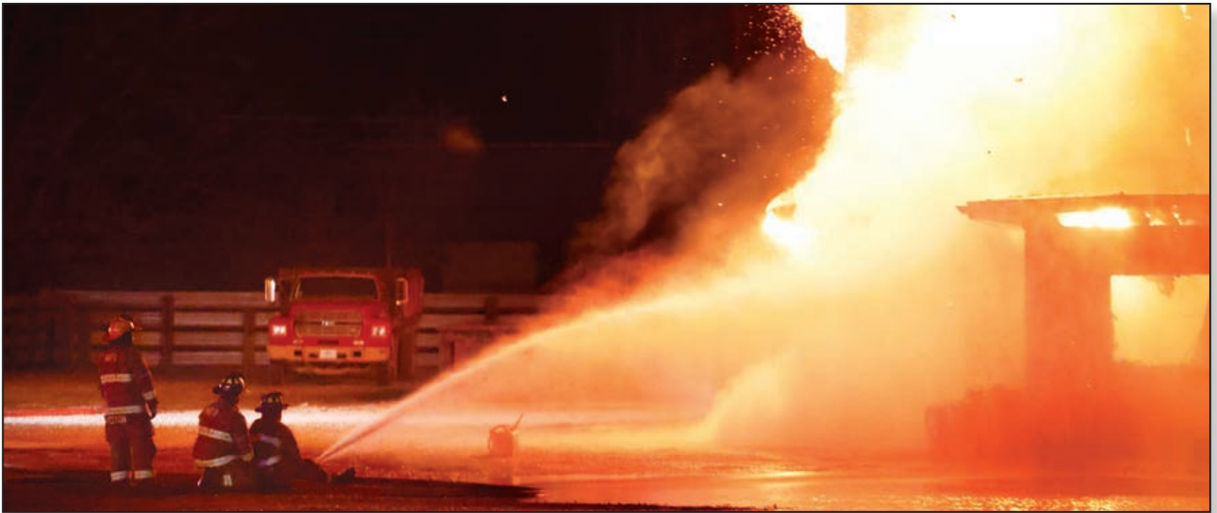
SPOT NEWS PHOTO Division E 1st Place: The Dispatch • The Rock Island Argus , Moline, Katelyn Metzger