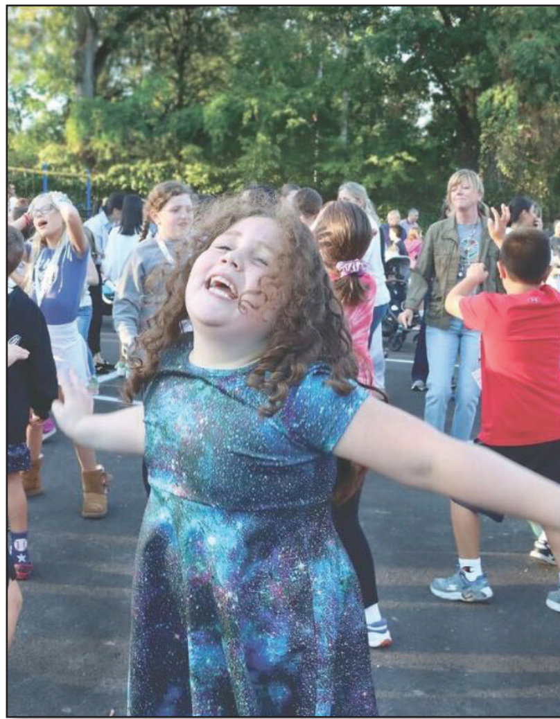
ONLINE PHOTO SERIES/GALLERY Division NonDaily 1st Place: The Hinsdalean, Jim Slonoff