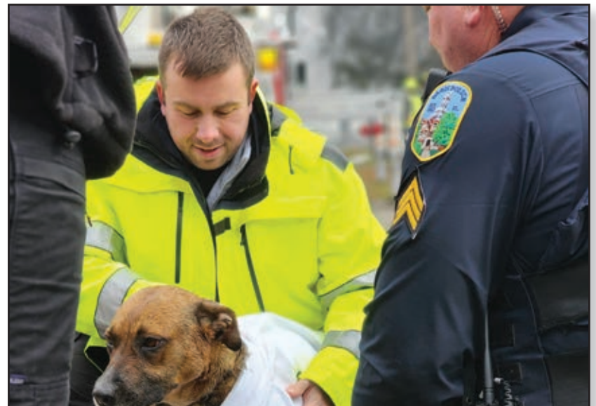
SPOT NEWS PHOTO Division C 1st Place: The Prairie Press , Paris, Bethany Wagoner