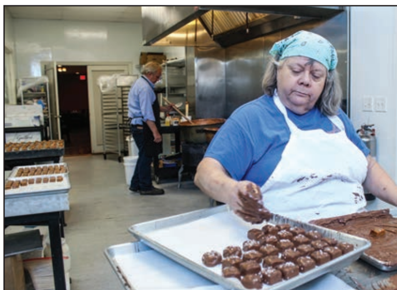
PHOTO SERIES Division C 1st Place: The County Chronicle, Tuscola, Staff