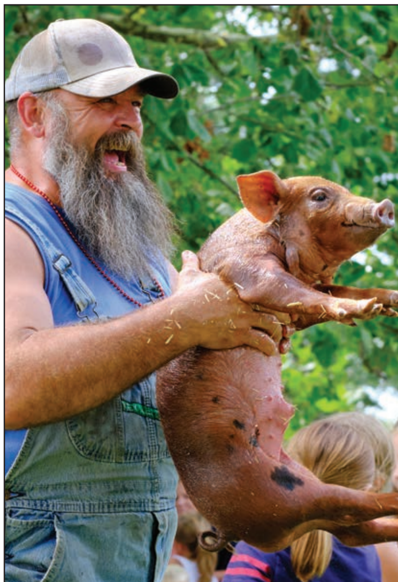
GENERAL NEWS PHOTO Division B 1st Place