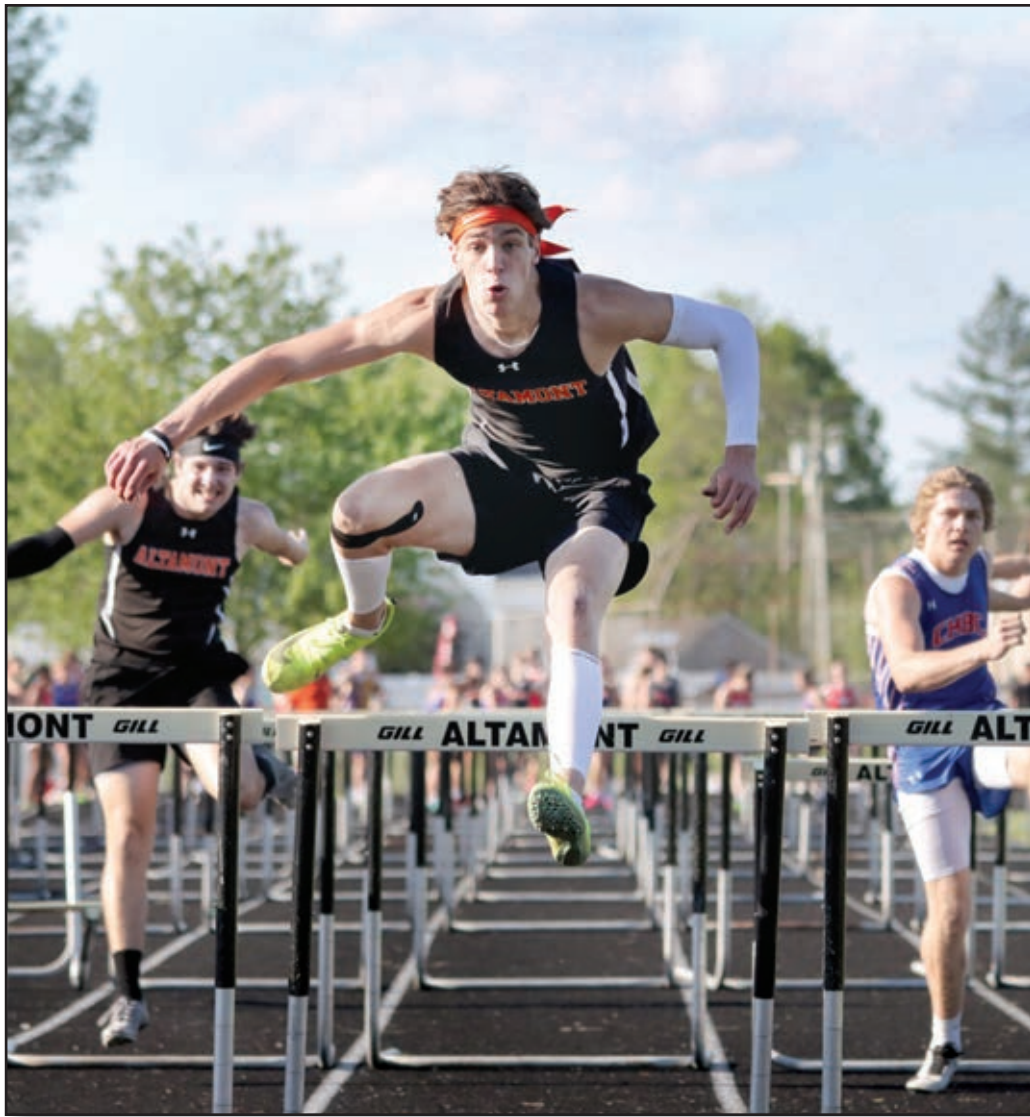
SPORTS PHOTO Division D 1st Place