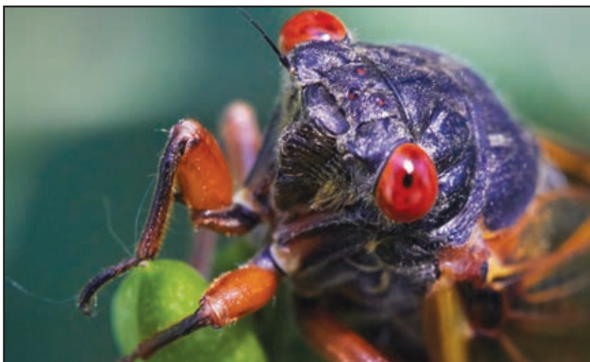
FEATURE PHOTO Division B 1st Place